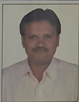
Trade Mark Image :